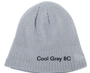
Cool Grey 8C