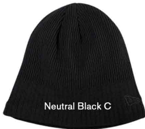
Neutral Black C