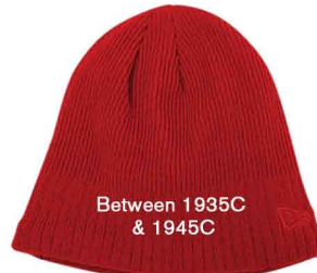
Between 1935C & 1945C